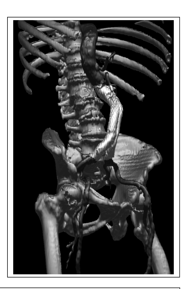
Figure 1 (from top to bottom and left to right): human hand showing bones and blood vessels (Tiani), renal stenosis (Vital Images), human skull and neck showing carotids (Tiani), aorta with stent and surrounding bones (Viatronix).