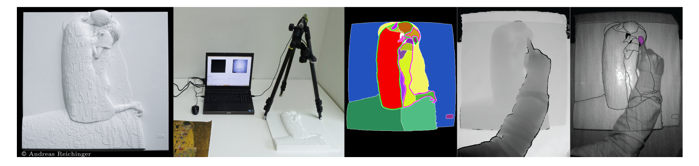
Figure 1: From left to right: a) Tactile relief interpretation of Gustav Klimt's "Der Kuss" (The Kiss, 1908/09); b) Test setup; c) Label image, warped to camera space. Outlines indicate merged base labels; d) Depth image; e) Infrared image with superimposed label borders and touched label (purple). © Andreas Reichinger

type is targeted at BVI people, according to a design-for-all philosophy, the system may be also interesting for children, elderly, people with cognitive impairments, and the general audience, possibly all with different interaction modes.